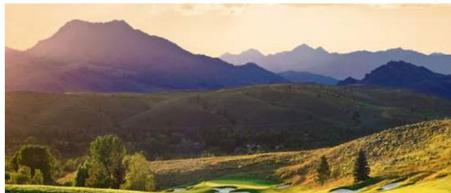
Elkhorn Golf Course

Coupled with fantastic views of the surrounding mountains and ever-present clear blue skies, you will find a round of golf on the Trail Creek Course a well-earned addition to any golf resume.