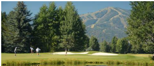
Trail Creek Golf Course

Sun Valley golf was most recently recognized by Golf Digest as one of the top 75 resort courses in North America. Sun Valley's signature course, Trail Creek, promises to provide a challenging round of golf for every level of player. Robert Trent Jones, Jr. designed this traditional alpine course in 1980 with a full compliment of stream carries and ominous bunkers well-positioned to catch the errant shot. Play crosses the beautiful Trail Creek seven times on the front nine alone!